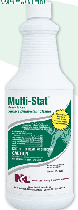
12 x 32 oz Bottles: Item # 0253-36